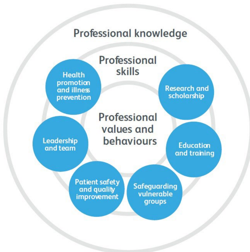
The nine domains of the GMC's Generic Professional Capabilities

Good medical practice (GMP) 3 is embedded at the heart of the GPC framework. In describing the principles, duties and responsibilities of doctors the GPC framework articulates GMP as a series of achievable educational outcomes to enable curriculum design and assessment.